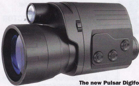
The new Pulsar Digiforce 860VS monocular at a price to good to ignore

A range of products will soon be available to consumers, including the hotly anticipated Mauser K98, based on the German bolt-action rifle.