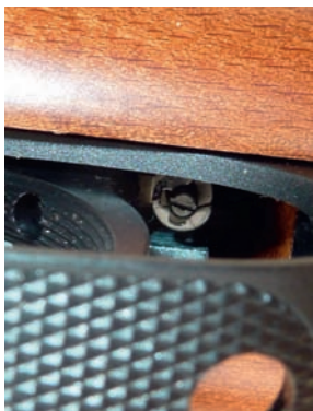
Right: The gently curving trigger blade.