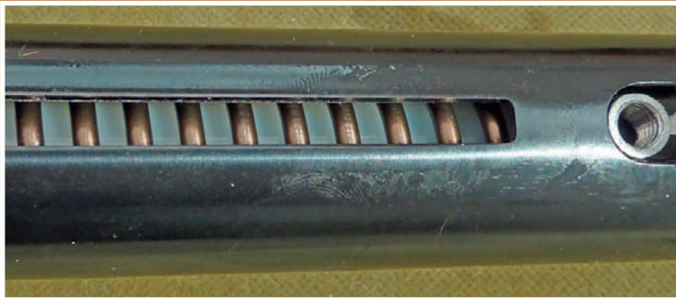
Above: Surprisingly, the mainspring was dry. A little moly grease wouldn't go amiss.