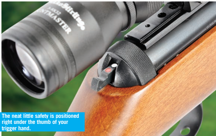
The neat little safety is positioned right under the thumb of your trigger hand.

Grammelspacher in Germany have opted for a single-piece cocking link, which, while being sturdy and simple, does require an elongated slot in the stock. This can be regarded as a weakness, but Diana seem to have preferred to keep the cocking link as strong as possible, and they've been in the airgun business for more decades than I care to remember, so I'd say they know what they're doing.