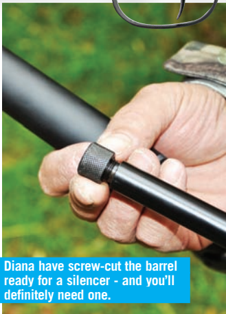
Diana have screw-cut the barrel ready for a silencer - and you'll definitely need one.

acclimatise everyone who tried the Diana, and I must once again commend the designers on it. It's been a while coming, but this trigger unit really does match the rest of the rifle in terms of quality and function.