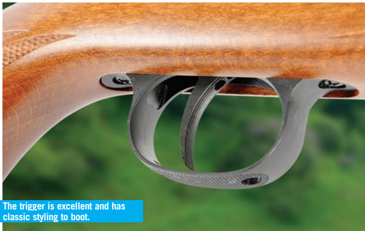
The trigger is excellent and has classic styling to boot.